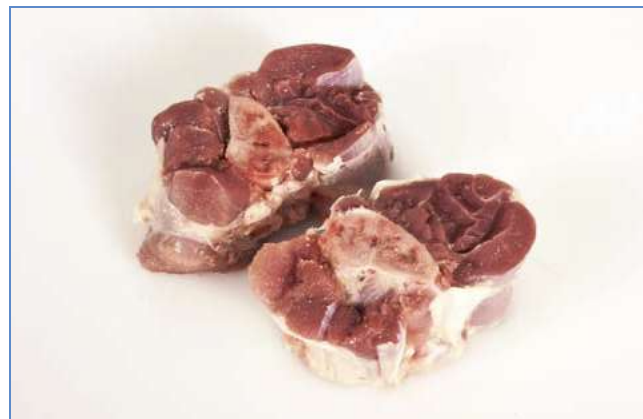
5 Shank – portions.