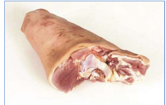
3 The rind is removed from the Shank.