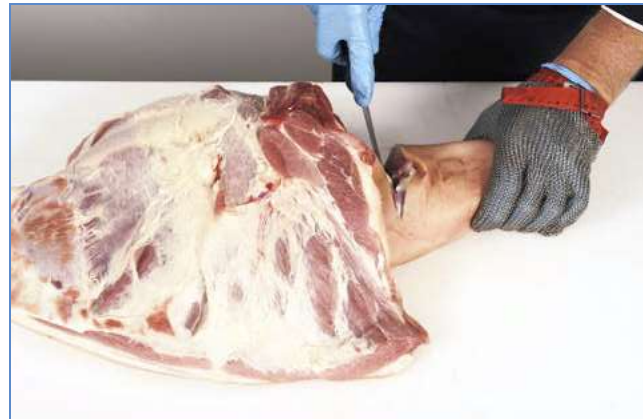
2 The Shank is removed from the shoulder through the joint.