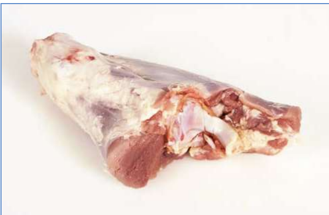
4 The Shank – rindless is cut/sawn into required weight portions.